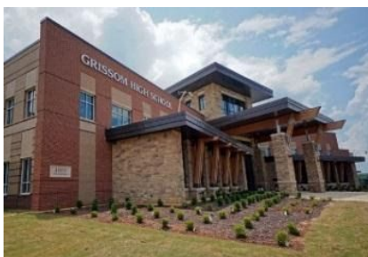
Grissom High School